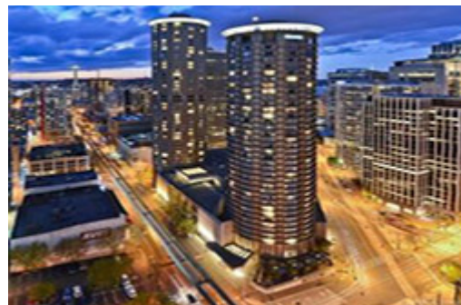
The Westin Seattle Shuttle service provided

1400 6th Avenue | Seattle, WA 98101 (315 ft | 1 min. walk) Room Rate: $239 + taxes