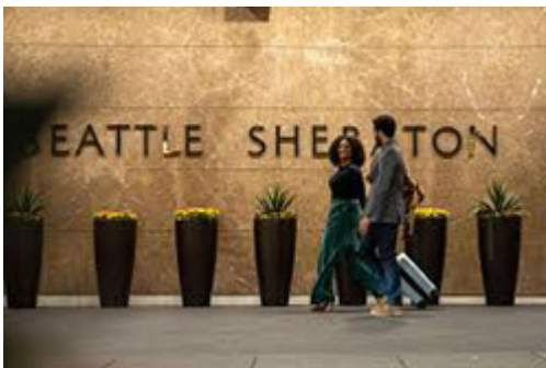
Sheraton Grand Seattle PRIMA Headquarters

PRIMA has secured a negotiated rate at the Sheraton Grand Seattle and The Westin Seattle, Sunday, June 1 - Wednesday, June 4. In an effort to support our host city of Seattle and keep registration fees lower, PRIMA asks that you stay at the contracted hotel. Reserve your room here.